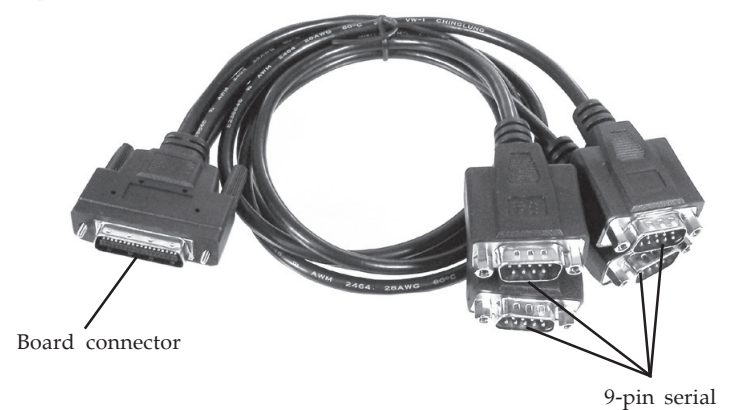
Figure 2: 4-port fanout cable