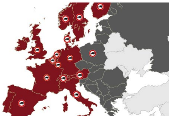
⚙ Countries with truck attributes