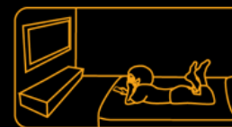
In your bedroom...