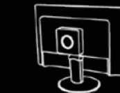
or LCD mount